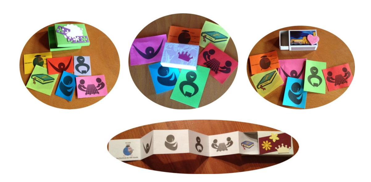
Items for the gift box (to cut it out)