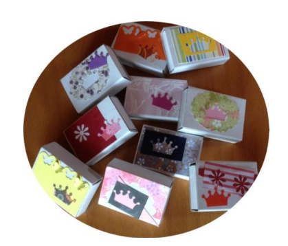
Ways to have it with you for display